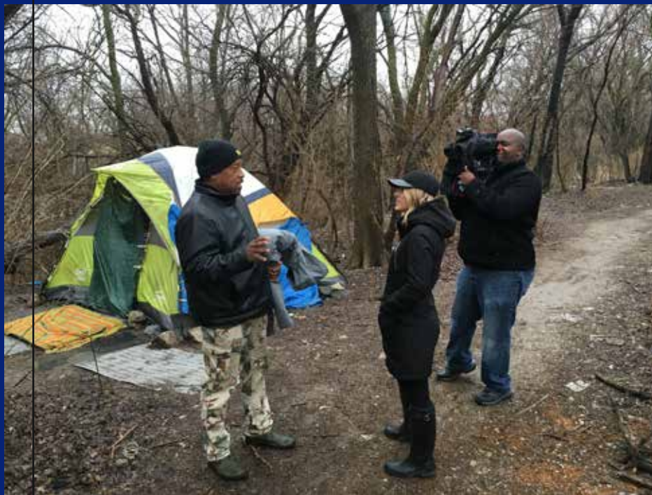
HVAF Outreach Team talks with local media about serving the homeless veterans in camps around Indianapolis.