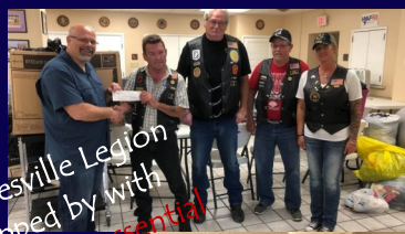
Mooresville Legion stopped by with a check and essential items!

HVAF hung out with vets at the annual Mayor’s Vet Appreciation picnic