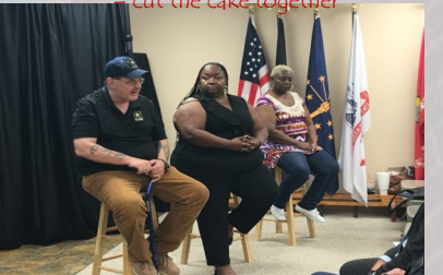
3 HVAF vets participated in a panel discussion– sharing how HVAF’s programs and services helped them

To view the entire Annual Report, including the top 12 Defining Moments from the past 25 years, click here .