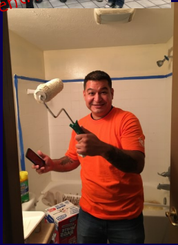
Home Depot painted our Manchester Apartments