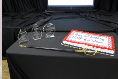
HVAF’s Annual Meeting & Birthday included awards and of course– cake!