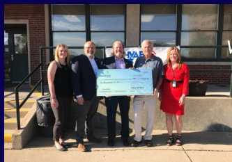
Westfield presented HVAF with a $4,000 check